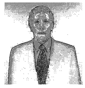
b. Intermediate Image