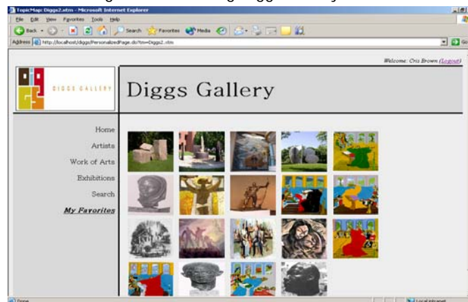
Figure 5. Diggs Gallery Portal: A personalized entry page for a registered user.