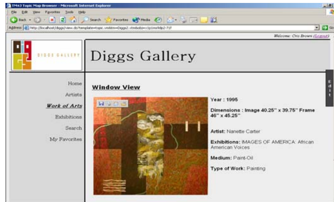
Figure 2. Diggs Gallery Portal: An artwork view.