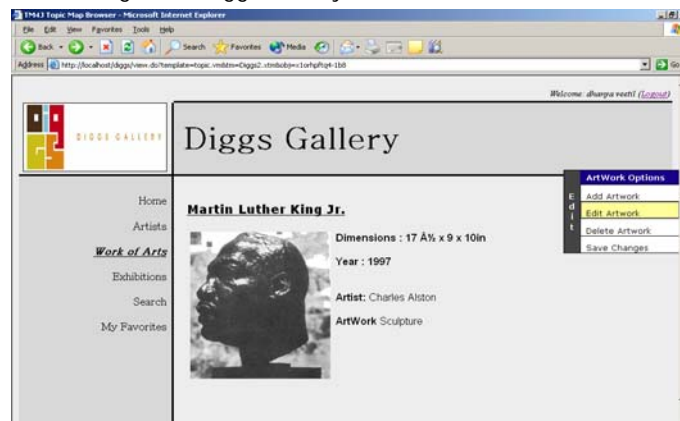
Figure 3. Editing functionality in the Diggs Gallery Portal.