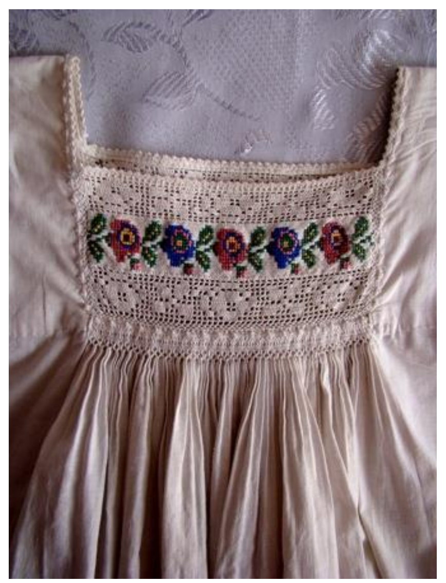
Figure 2. The fragment female "volòska" shirts body front, Velykyi Bychkiv center: neckline with square (deepening in front and back) cutout, with puckering, lace and embroidered embellishments. 1930s, Dilove village Rakhiv district, Transcarpathian region. AFM. 2016.

necklines were tied with a rope "na ochkúr", which created a certain volume and texture. The puckers were fixed with thin collar, which was tied with narrow shopping ribbons. The lower part of the sleeves was also puckered under narrow embroidered cuffs ("dúdy") (AFM) (Kozakevych, 2018a). From the beginning of the XX century, and especially in 1920—1930 (Czechoslovakian period) in the manufacture of shirts industrial fabrics (silk, artificial silk) have been spreading. There were one-color, white, often with stylized plant patterns in thin fabrics. Shirts made of such fabrics were sewn from two parts: the top (namely, shirts) from silk fabric, and the bottom—a skirt ("pídtychka", "pídshytka", "pídshyvka") which was often made from four parts ("pílkas") of homespun fabrics (AFM). These parts were connected with decorative embroidery stitches of an openwork texture (Polianskaia, 1972), often with multicolored threads, which emphasized the constructiveness of the line and enhanced the decorative effect.