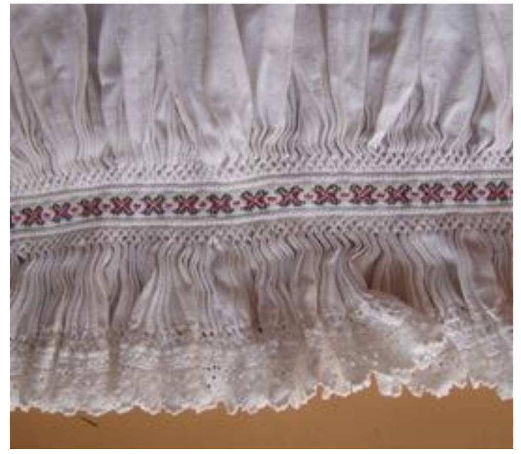
Figure 5. The fragment the lower part of the collar with puckered ruffle cuff ("fòdra", "fòdrosh") of female "volòska" shirts Velykyi Bychkiv center: embroidery, crocheting, "bryzhi". 1930s, Dilove village Rakhiv district, Transcarpathian region. AFM. 2016.

The decorative openwork inserts are a characteristic feature of the "volòskyi" female shirts. They were on the chest part of the shirt, crocheted or made from industrial lace, in combination with embroidery. Sometimes they were sewn on the shoulder part of the sleeves (something like the shoulder insert named "ùstavka"), on the lower cuffs. The decorative strip, most often consisting from three parts — horizontally laid ribbons, in combination with embroidery, reached a width of up to 15 cm: the central one was embroidered on the fabric, on both sides of which there were lace. In contrast to the dominance of geometric ornament in the embroidery of the north-central part of Rakhiv region, the embroidery of "voloskyi" shirts are mainly characterized by a phytomorphic ornament. These were mainly floral motifs combined with leaves, realistic or stylized outlines. Lace practically repeats ornamental motifs of embroidery or as close as possible to it as far as technological methods of crocheting allow [Fig. 6].