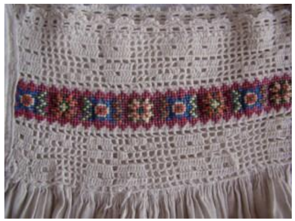
Figure 6. The fragment female "volòska" shirts body front, Velykyi Bychkiv center: openwork (crocheting) and embroidered (cross stitch "khrèstyk") decorative insert. 1930s, Dilove village Rakhiv district, Transcarpathian region. AFM. 2016.

Research of folk shirts in Transcarpathian Hutsul region of the end XIX-early XXI century indicates a change in the tradition of décor them during this period. There are also local features that emphasize the multicultural of the defined area. For example, shirts from the northern part have more in common with shirts from the Galician Hutsul region. This is embroidery on home-made canvas, monochrome geometric ornament. The products of the southern part differ in the cut, dominants floral ornament and more lace in the decoration. This is due to the influences of Romanian and Slovak attire. So the decor of shirts of the northern and southern part of the Transcarpathian Hutsul region differs quite significantly. Decorative characteristics changed during the XIX–XX centuries under the influence of sociocultural factors, urban fashion in particular. From the beginning XX century in the folk costume are distributed industrial fabrics significantly influenced their use in sewing traditional clothing. During 1920—1930s for shirts was used silk-like fabric. The popularity and availability of beads creates a new technological version of embroidery: often instead of threads use beads.