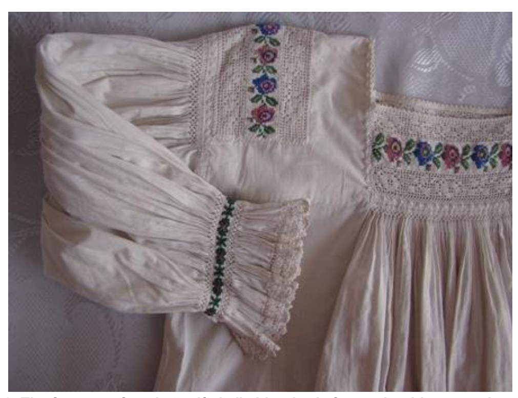
Figure 3. The fragment female "volòska" shirts body front, shoulder part, sleeves with cuffs, Velykyi Bychkiv center: neckline with square (deepening in front and back) cutout, with puckering, lace and embroidered embellishments. 1930s, Dilove village Rakhiv district, Transcarpathian region. AFM. 2016.

Female shirts ("volòski") of the southern Rakhiv region, namely from Velyky Bychkiv center, differ substantially from the Yasinia`s and Bohdan`s items, as well as the Hutsul ones, in particular, mainly in cut and decor: tunic-like ("vperekýd"), "dodìlnyi", sewn from several wide straight rectangular panels, due to which a larger volume was obtained. Sometimes they made the upper part of the shirt from the better quality fabric and the lower part they sew from the cheaper one. Probably, this was done solely from practical consideration, whereas on the top of the shirt they wore a skirt made of industrial fabric — "sùknia". There were no in "volòska" shirts, and they had deep square cutouts in the item`s body front and back (AFM) [Fig. 2; Fig. 3].