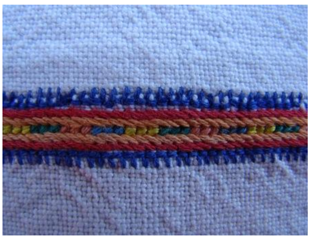
Figure 1. The fragment of decorative stitches by "tsýrka" for joining parts of the female shirt hem ("pídtychka", "pídtichka", "pídshyvka"). The middle XX century. M. Moldavchyk property (1952). Bilyn village, Rakhiv district, Transcarpathian region. AFM. 2016.

items from Velykyi Bychkiv have some distinguish features. They were made from white fabric, widened to the bottom and more shortened in comparison with the "Hutsul" ones, embellishments along the bottom hem with small fringes ("striápky") and embroidery with threads in shades of white (AFM). Pants of this type were common in Romanian, Slovak and Hungarian male clothing. This emphasizes the ethnolocal and artistic characteristics of these items and makes them unique against the background of other components of waist elements of male wear in the Hutsul region.