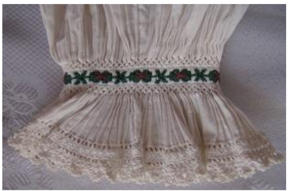
Figure 4. The fragment the lower part of the collar with puckered ruffle cuff ("fòdra", "fòdry", "fòdrosh") of female "volòska" shirts Velykyi Bychkiv center: embroidery, crocheting, "bryzhi". 1930s, Dilove village Rakhiv district, Transcarpathian region. AFM. 2016.

(depending on the ornament width) at the distance of 6—7 cm from the bottom edge of the sleeve. They tightly laid and fixed with two lines of stitches vertical folds, as a result of which a textured plane was created (2.5—3 cm). Geometric and stylized plant motifs were embroidered on top of the folds "bryzh" with coloured threads, laying the stitches transversely to the vertical fold "zbỳrky", in this way additionally fixing the folds "brỳzhi". The lower open edge of the sleeve (or cuff) was decorated with lace of various widths — with fancy edges ("zùbtsi", festoons), varying degrees of openwork, which gave the product a special embellishment effect (AFM) [Fig. 4; Fig 5)].