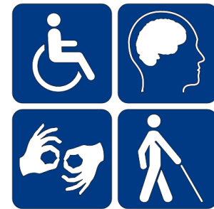
Fig. 2. Types of Disabilities, Source:

Web accessibility means that websites, tools, and technologies are designed and developed so that people with disabilities can use them and more specifically people can: perceive, understand, navigate, and interact with the Web; contribute to the Web; Web accessibility encompasses all disabilities that affect access to the Web, including: auditory, cognitive, neurological, physical, speech, visual (Fig. 2).