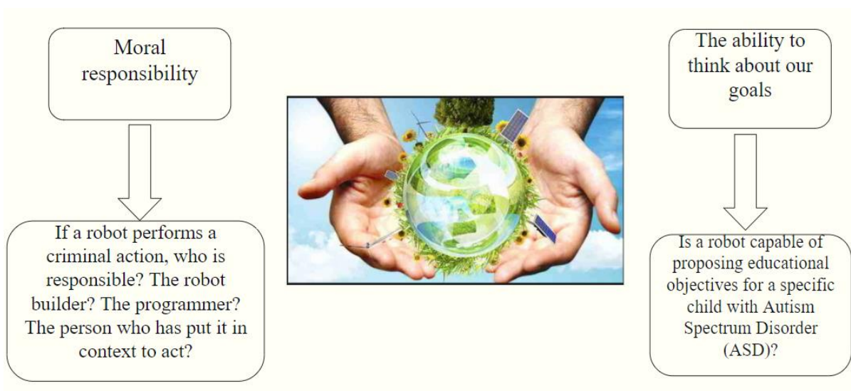
Fig. 3. Ethics

Figure 3 presents the ethical issues and questions that need to be asked and that researchers need to answer before involving robots in the educational process at school.