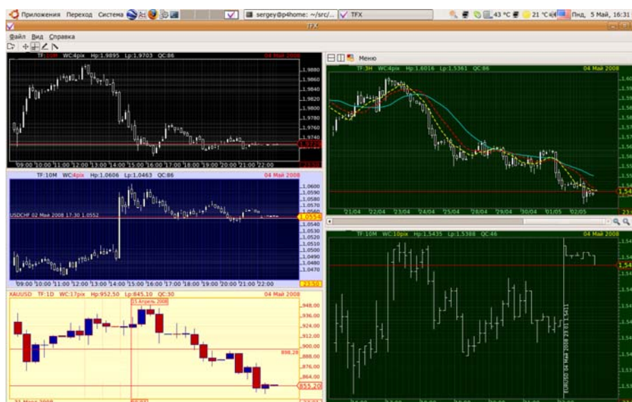
Monitoring current nature parameters on slope and allowed differences

Such computer system of decision-making support grants to expert possibility to handle easily great volumes of the information in realtime a time scale, allowing it to obtain the objective data and make the value judgment. Using effective estimations expert can easily control many parameters during time, along with allowed changes in them: