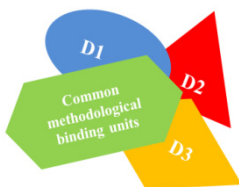
Figure 1. Model of interdisciplinary connection

The use of computer technologies in higher education system makes the integration of the IIT discipline possible. Integration is a complicated process that has a structure that consists of two or more disciplines (D1, D2, D3, Fig. 1), connected by common methodological binding units . It has a positive effect on students' psychics, indicating that acquiring knowledge is not an end in itself [5].