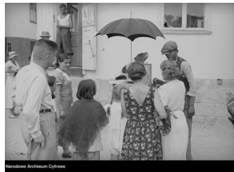
Fig.3. On the market in Kosiv. Hucul region, 1936. 3/131/0/-/455/58

The Hutsul Region is also represented on the NCA website by several photos in the album «National Minorities» (Mniejszości narodowe).