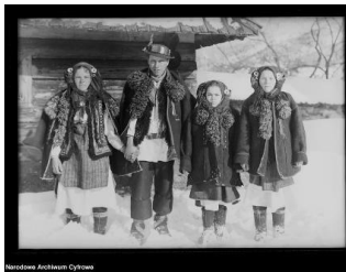
Fig.2. Photographer - Henryk Poddebski. On the left - brides, on the right - bridesmaids. Wedding photo, Hucul region, Zhabje (Verchovyna), 1935. NAC, Archiwum fotograficzne Henryka Poddębskiego. 3/131/0/-/455/20